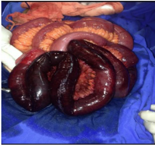
Figure 2: Necrotic colonic tissue before resection we can observe the colonic wall with necrotic tissue