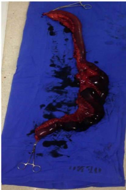
Figure 4: Resected portion of intestine