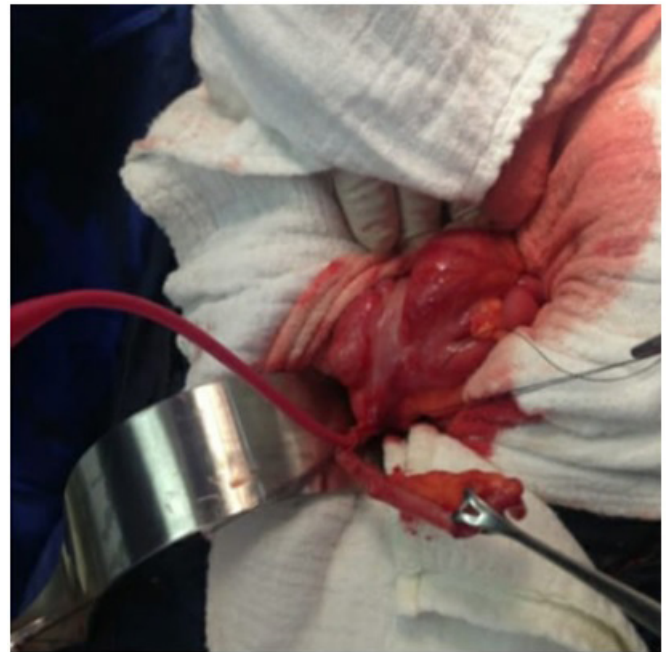
Figure 6: Cecostomy site