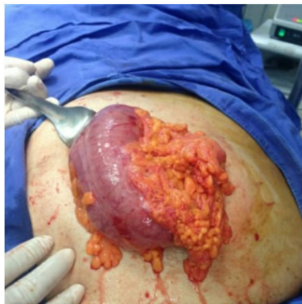
Figure 1: Toxic megacolon, located on hypogastrium region

with vomiting, 35% with diarrhea, and 16% with blood per rectum [2, 6]. We report a case of superior mesentery artery ischemia, resulting in a toxic megacolon, who presented with abdominal pain and signs of bowel obstruction.