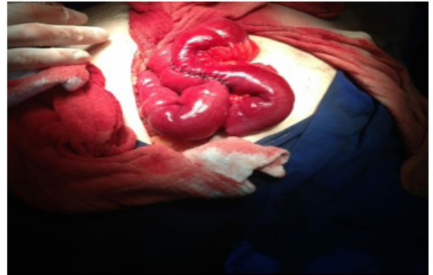
Figure 5: In this image we can visualize the colon with a laterolateral anastomosis performed on the colonic tissue

A 72 year old man presented to office in the San Martin Clinic located in Guadalajara, Mexico with severe abdominal pain that started a few hours ago and irradiated to his back, as well as bloody diarrhea, nausea and vomiting, patient has a history of hypertension, diabetes mellitus since 15 years ago and atrial fibrillation, he is also a heavy smoker since 50 years ago, he didn't drink nor had any other major problem in his personal background, patient is evaluated and is believed to have a toxic megacolon . for which immediate surgery is performed.