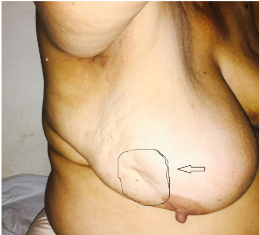
Figure 3: Ca Right Breast